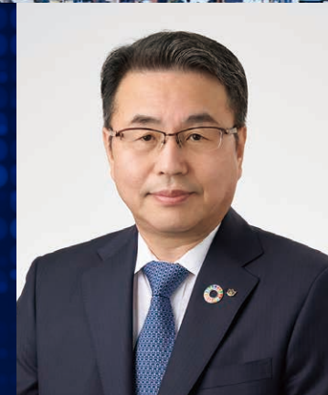
President, Daiwa Institute of Research Ltd.

Daiwa Institute of Research has been supporting the business foundation of the Daiwa Securities Group and our other clients. We have also been focusing on the cultivation of data scientists and other highly-advanced IT specialists as we continue deepening our knowledge of cutting-edge technologies. Continuing to accept the challenge of new fields by accumulating experience and knowledge, we provide new value, and contribute to the sustainable growth of society and the economy.