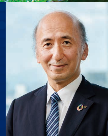
Chairman of the Institute, Daiwa Institute of Research Ltd.

A think tank in a new era that faces a new phase requires the ability to calmly analyze, to maintain its curiosity about the unknown, to persistently investigate, show insight ahead its time, to think flexibly and creatively, and especially maintain its enthusiasm about contributing to society. Daiwa Institute of Research has accumulated knowledge and know-how through its long history not only as IT and consulting specialists, but also as a think tank. Diverse human resources have been learning both in and outside the company. The areas in which our specialists exercise their innovative competencies and in which we as an organization are expected to contribute continue to expand. Steadily accumulating positive achievements, we strive to be a Japanese think tank that distinguishes itself on the global stage.